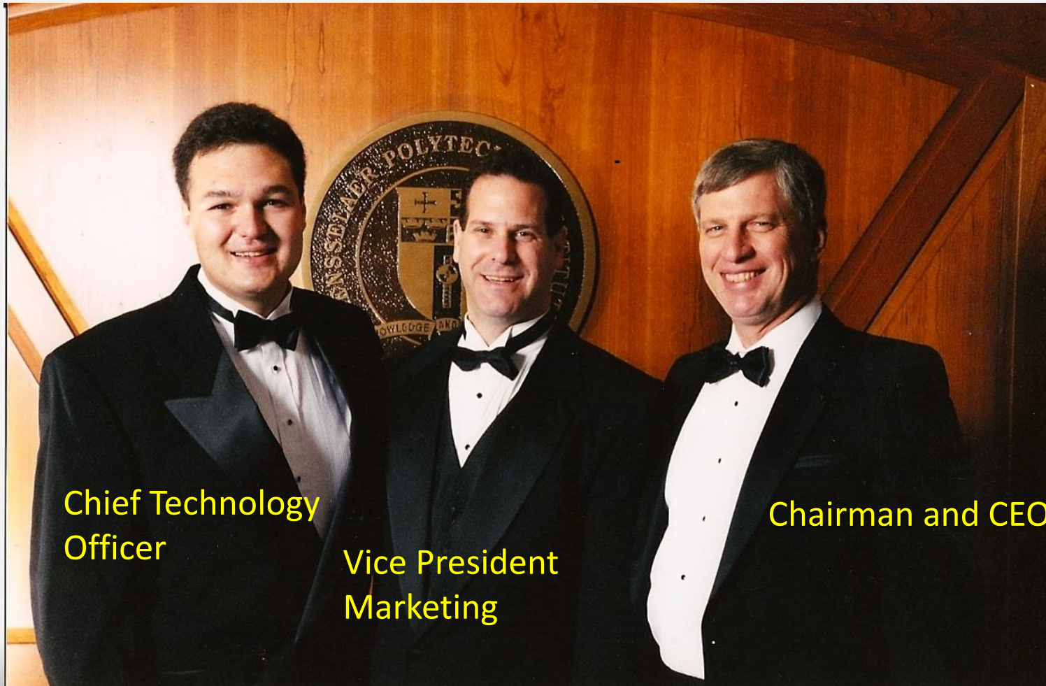
Chief Technology Officer