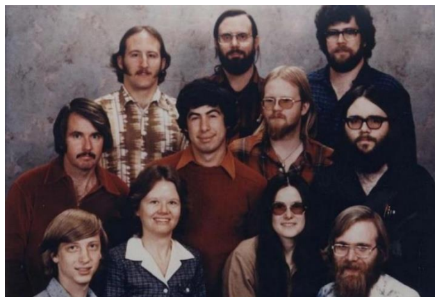
Figure 2 Microsoft Founders

By taking a brief look at a few entrepreneurs, perhaps we can glean some insight into who they are, what motivates them, and how they operate. We will want to build on this insight throughout the text by looking at the research that defines entrepreneurial characteristics, but having some concrete stories will illuminate the dry statistics.