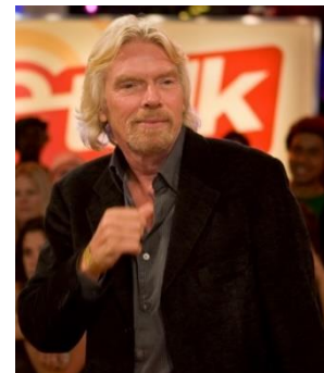
Figure 14 Richard Branson

He helped form and fund "The Elders" with Nelson Mandela and others who were devoted to helping to solve world problems.