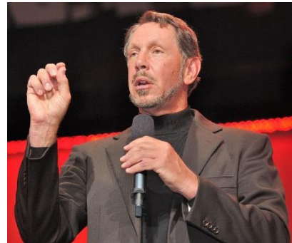
Figure 13 Larry Ellison

He signed the Giving Pledge along with Bill Gates, Warren Buffet and others. The giving pledge was a promise to donate most of their acquired wealth to charity in some form. 9,10