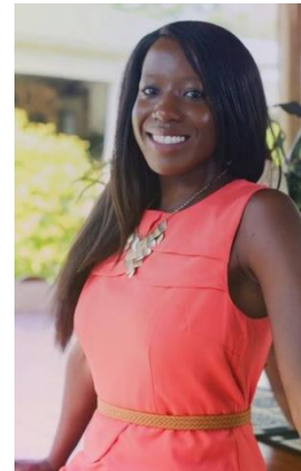
Figure 15

Case: http://www.jackmwilson.net/Entrepreneurship/Cases/Case-EcoSchool-Africa.pdf