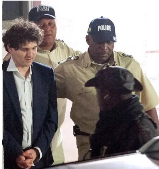
Figure 19 Samuel Bankman-Fried Arrested

Wang and Ellison pled guilty to various counts of fraud and are expected to testify against SBF who was arrested in the Bahamas and charged with a number of crimes including fraud and illegal campaign donations. As of the beginning of 2023, the various court cases were in the preliminary stages.