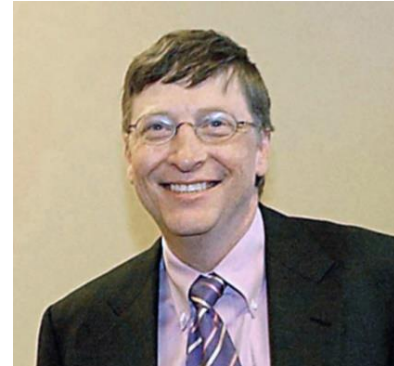
Figure 4 Bill Gates

When IBM decided to get into the personal computer business, they designed the first IBM PC hardware, but needed an operating system for the PC. An operating system already existed; it was called CPM. Writers argue about whether it was because IBM was too cheap to license CPM or simply because negotiations broke down for other reasons, but the result was that IBM looked around to find someone to write clone of CPM. They contracted with Gates and his fledgling company, Microsoft. To develop that operating system they built on an existing operating system that they purchased to create MS-DOS which IBM branded as PC-DOS. In what many consider one of the greatest business blunders of the time, IBM left the underlying rights to the operating system with Microsoft. Thus Microsoft was able to work with others who wanted to clone the IBM PC and those others MS-DOS. The rest is history (after long expensive lawsuits that is!)