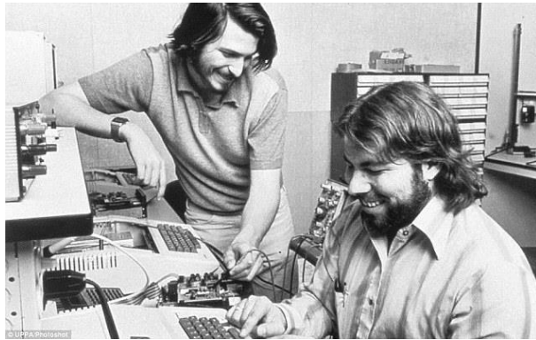
Figure 3 Apple Founders Steve Jobs and Steve “Woz” Wozniak

These two guys in Figure 3 started their collaboration in a basement. They were as different as anyone could imagine, but were united by a vision for creating computers that would be personally owned. They were not the first to do this, but, apparently, they did it better than anyone else. Steve “Woz” Wozniak was the technical genius who built the Apple I computer and did the technical work to build the Apple II.