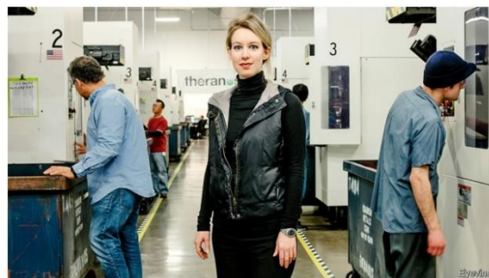
Figure 11-Elizabeth Homes

The saga of Theranos highlights the danger of glorifying novice entrepreneurs