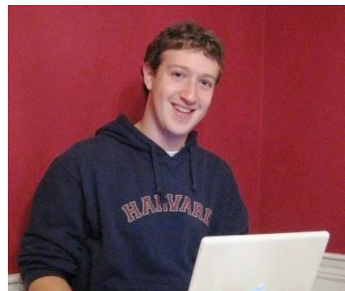
Figure 16 Mark Zuckerberg -Flickr: This file is licensed under the Creative Commons Attribution 2.0 Generic license.

"big juicy fun" rather than "reportage" and the screen writer admitted that "I don't want my