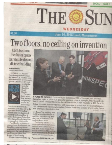
Figure 8 Nonspec in the Lowell Sun