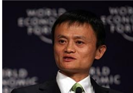
Figure 23 Jack Ma -Alibaba

Jack Ma (Ma Yun) 18 born in 1964 in Hangzhou, Zhejiang Province, China. He became the richest man in China and in the top 20 of the world. Surprisingly, he failed the university entrance exam three times, but eventually graduated from Hangzhou Normal University in English in 1988. In 1999, Jack Ma founded the website Alibaba.com 19 , a business-to-business portal to connect Chinese manufacturers with overseas buyers.