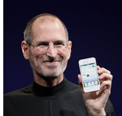
Figure 21 Steve Jobs

The late Steve Jobs is one of the best-known entrepreneurs for his founding of Apple with Steve “Woz” Wozniak in 1976 to sell the Apple I and then II computers. They were hugely successful and were followed up by the Macintosh.