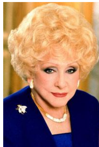
Figure 20 Mary Kay Ash

What motivated Mary Kay from the beginning was that she