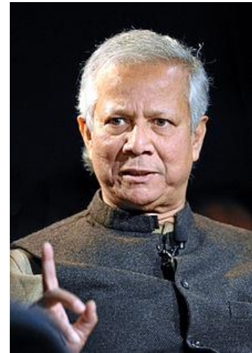
Figure 18 Muhammad Yunus

He is credited with creating the system of microcredit and microfinance and was awarded the Nobel Peace Prize for that work. He founded Grameen Bank to make these programs viable, sustainable, and scalable. In the late 1980s, Grameen started to diversify by attending to underutilized fishing ponds and irrigation pumps like deep tube wells. As these project grew and diversified, the fisheries project became Grameen Motsho ("Grameen Fisheries Foundation") and the irrigation project became Grameen Krishi ("Grameen Agriculture Foundation"). In time, the Grameen initiative grew into a multi-faceted group of profitable and non-profit ventures, including major projects like Grameen Trust and Grameen Fund, which runs equity projects like Grameen Software Limited, Grameen CyberNet Limited, and Grameen Knitwear Limited, as well as Grameen Telecom, which has a stake in Grameenphone (GP), the biggest private phone company in Bangladesh. From its start in March 1997 to 2007, GP's Village Phone (Polli Phone) project had brought cell-phone ownership to 260,000 rural poor in over 50,000 villages. 17