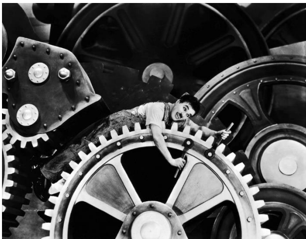
Figure 1 Charlier Chaplin in Modern Times public domain

proposed his theory of creative destruction . This simply suggests that new products and technologies make old products and technologies obsolete and completely replace them. Later we will look at many examples of this.