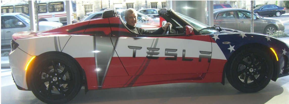
Figure 1 The first Tesla Electric Roadster

Tesla is an all-electric high performance automobile introduced in 2003 to a market that was probably not yet ready for it.